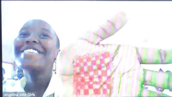
Angelina Jolie Girls