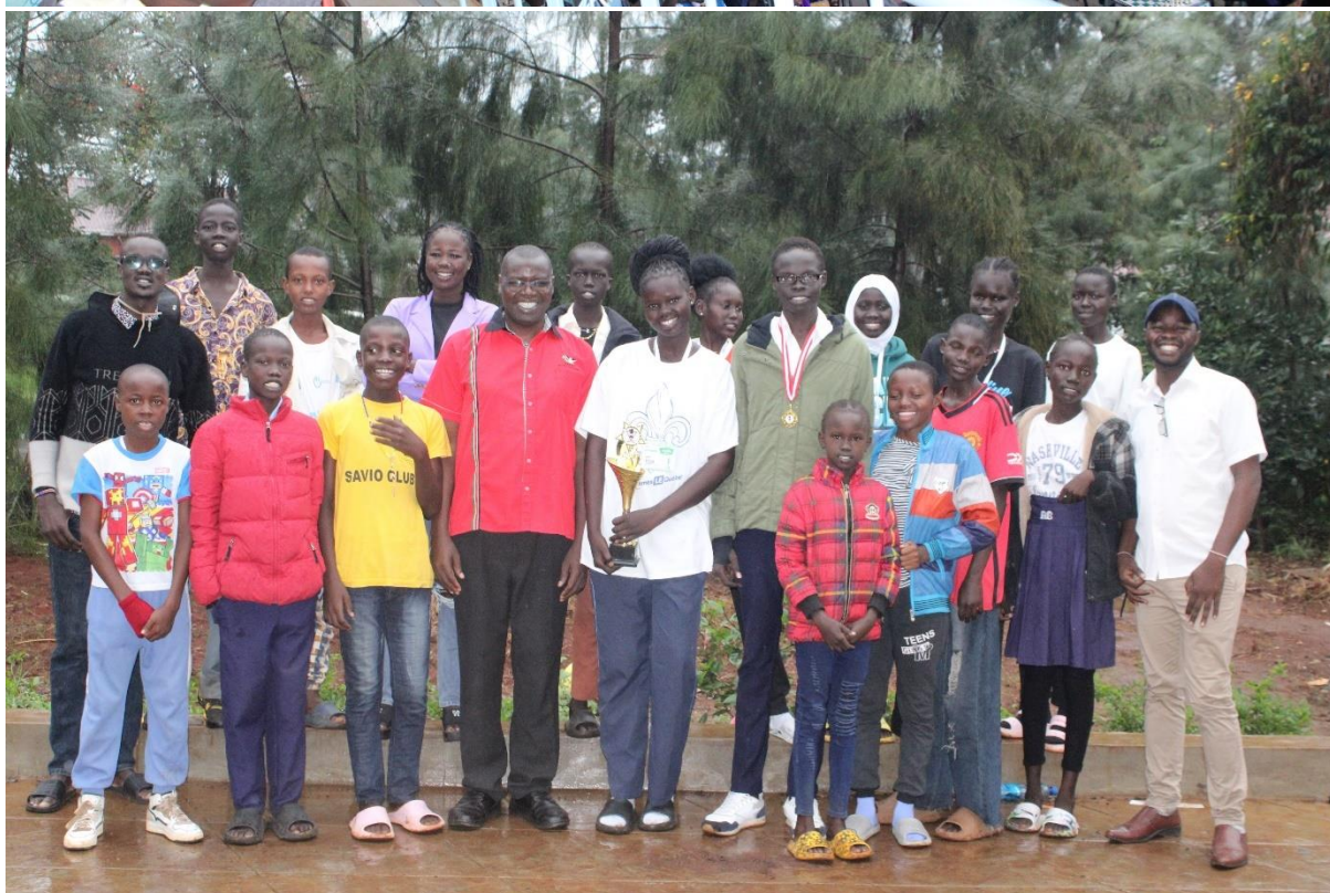
3. Qualification for Chess Olympiad held at Youth Centre 2 (April 2,2024)